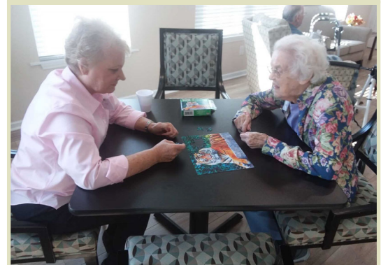
The Next Door Group Respite program serves as another resource for caregivers.