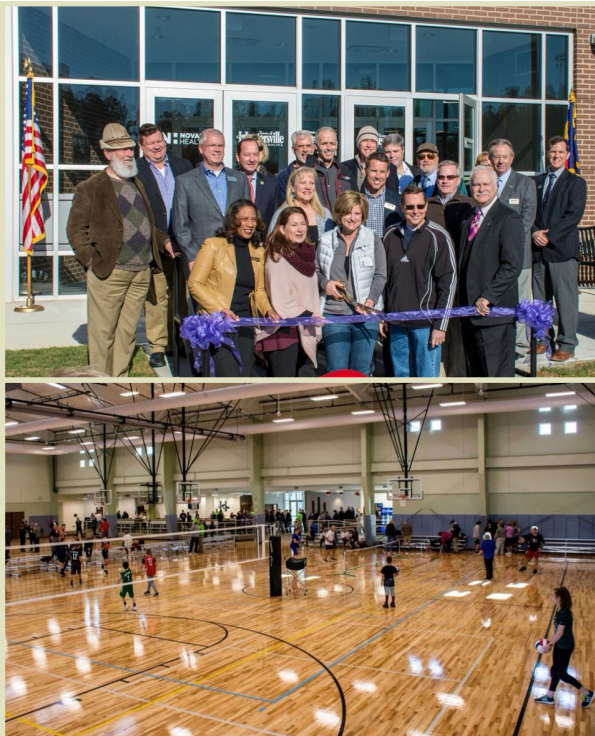
The 24,000 square foot indoor recreation facility represents public-private partnerships saving taxpayers millions of dollars.

The new Huntersville Recreation Center opened in January 2018. This 24,000 square foot recreation center includes two high school sized basketball courts, eight side basketball goals, four volleyball courts, four pickleball courts, café/lounge area, multipurpose room, office space and outdoor walking trail. This facility was designed for a future expansion due to anticipated future growth.