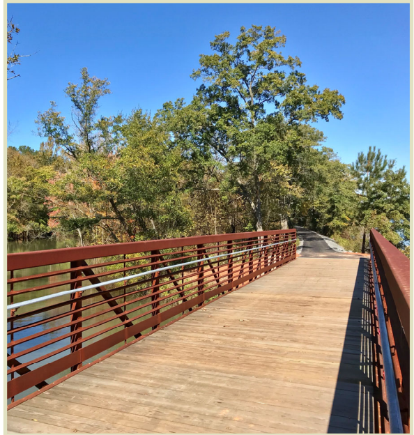
The recently completed River Front Greenway Bridge.

From the very first greenway meetings, the themes of encouraging public participation through public and private sector leadership and enhancing social equity have been at the forefront of this endeavor.